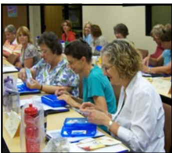
School Nurse Workshop attendees explore the contents of dental emergency packets given by Webb Orthodontics.

On Monday, August 11, a workshop was held to coordinate and inform school nurses of Western Nebraska.